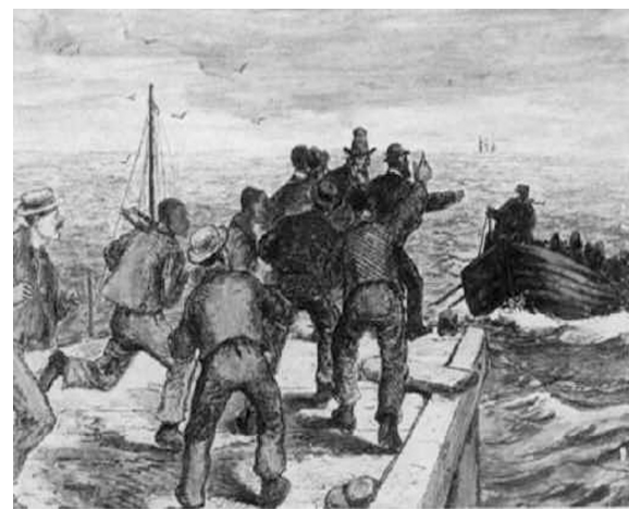
The Fenians Escape from Fremantle.

Shortly after 8.00am on Easter Monday the six Fenians slipped away from their work detail, their guards recuperating from Easter celebrations, rendezvoused with Breslin and the carriages and raced down the Rockingham road. As they made contact with Anthony on the shoreline danger appeared on the horizon in the form of HMS Georgette with twelve pounder cannons and British marines. The whaleboat