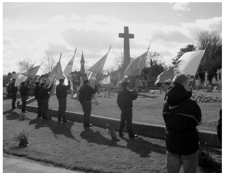
From Clockwise: Derry Commemoration, Cork Colour Party, Masked Volunteer (Derry).