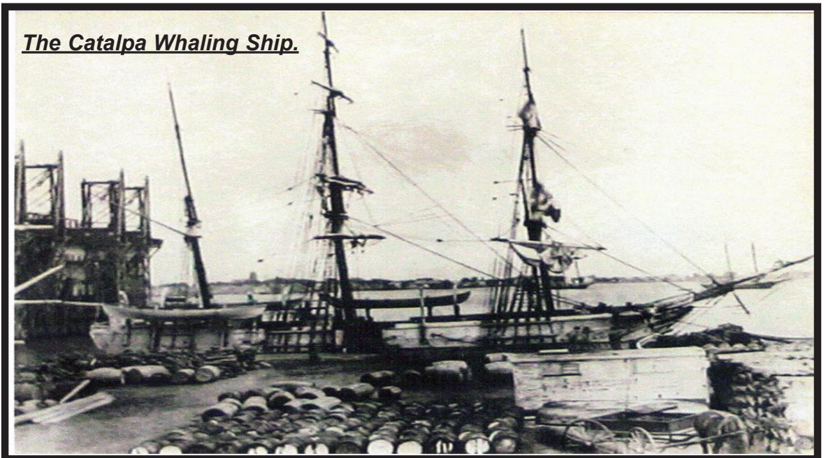
The Catalpa Whaling Ship.