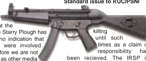
Heckler and Koch MP5: Standard issue to RUC/PSNI

tion was directed at the INLA. The Starry Plough has received no indication that the INLA were involved and therefore we are not prepared, as other media outlets have been, to wildly speculate as to who carried out the