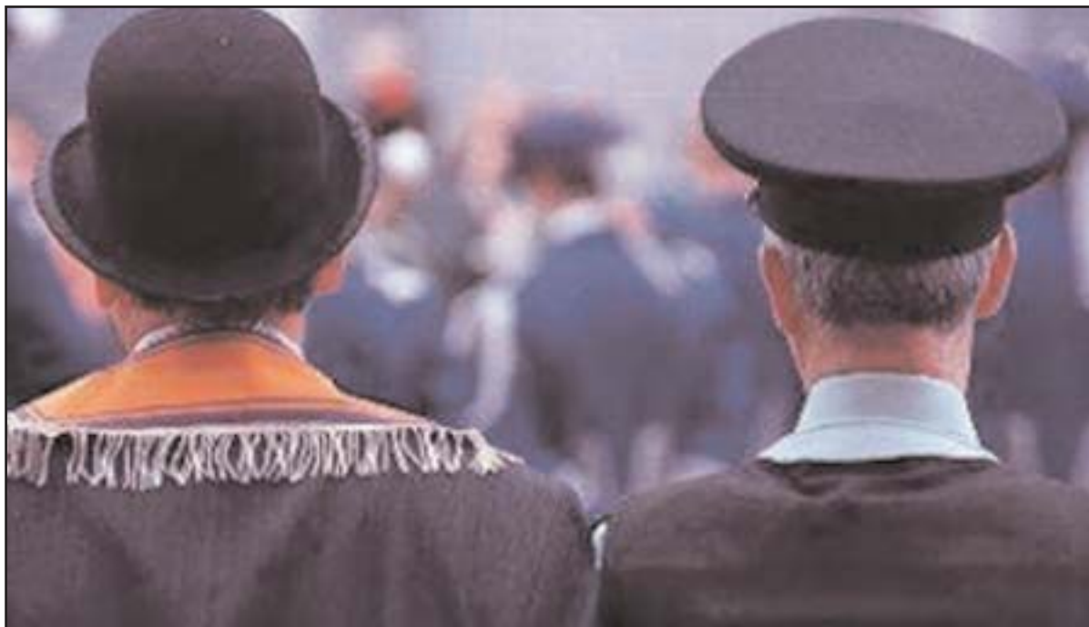
Masters and Servants, accountable to no one.

The SDLP supports the new police force. It is a matter of time before Sinn Féin also does. The party has already dropped the "Disband the RUC!" slogan, replacing it with "Implement