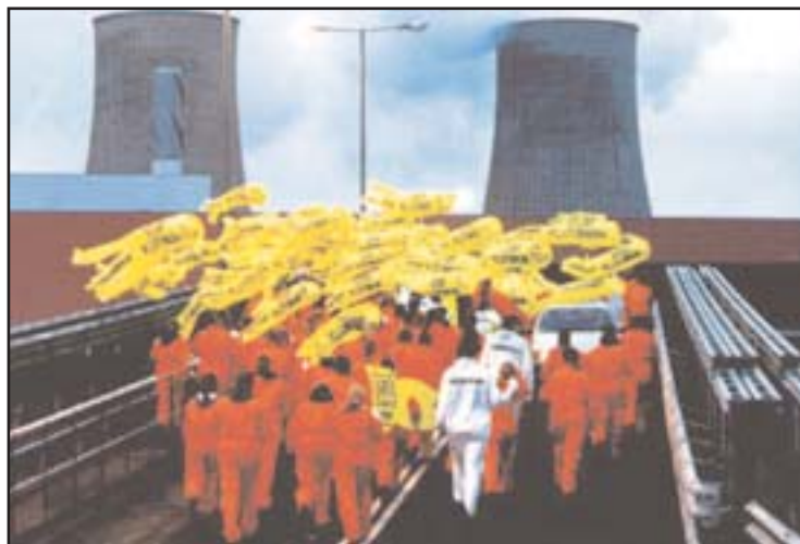
Protesters head for the Mox plant in Sellafield in 1995