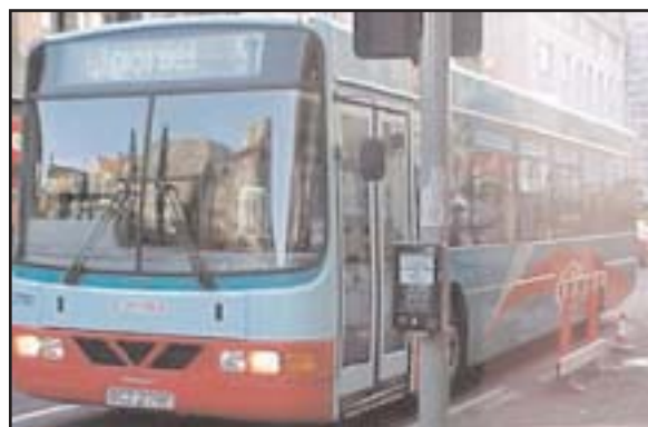
After the cutbacks... This bus is going nowhere except for the depot.

"Transport cuts are not being made for the safety of workers but for bosses' profits and all cuts or cancellations will inevitably lead to job losses, which is what Translink have in mind."