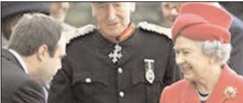
Nigel Dodds bows before the British monarch during her recent visit to Ireland

In a statement issued on 15/11/01 a spokesperson for the Irish Republican Socialist Party described the visit by the British State's Monarch as 'gut wrenching'.