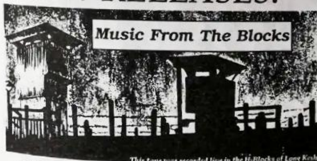
Music From The Blocks

This band was recorded live in the H-Blocks of Long Kesh