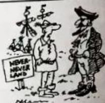
"They're all agreed... this is the name for the Northern Ireland site!"

"This misinformation totally destroys DuPont's credibility on the toxic incinerator issue. Can anyone now seriously trust DuPont to build or administer a toxic waste incinerator? If DuPont were prepared to mislead the public on this point of fact, what would they be prepared to do when massive profits are at stake, such as in the ownership and operation of Ireland's sole toxic waste incinerator?"