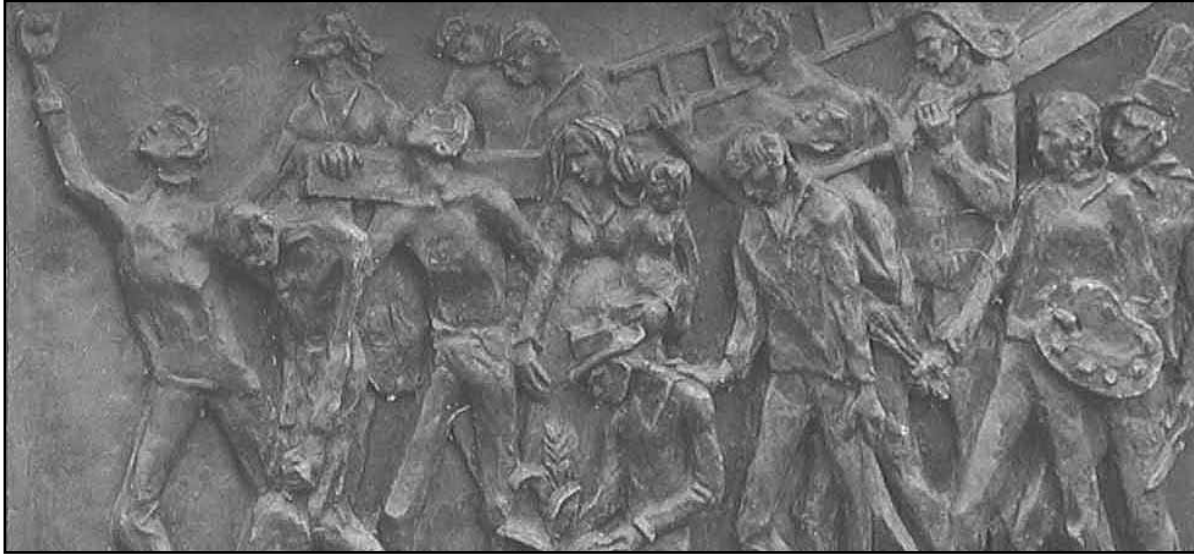
The 10th of December 2003 marked the 29th anniversary of the founding of the Irish Republican Socialist Party and the Irish National Liberation Army.

Statement Issued By The Irish Republican Socialist Party