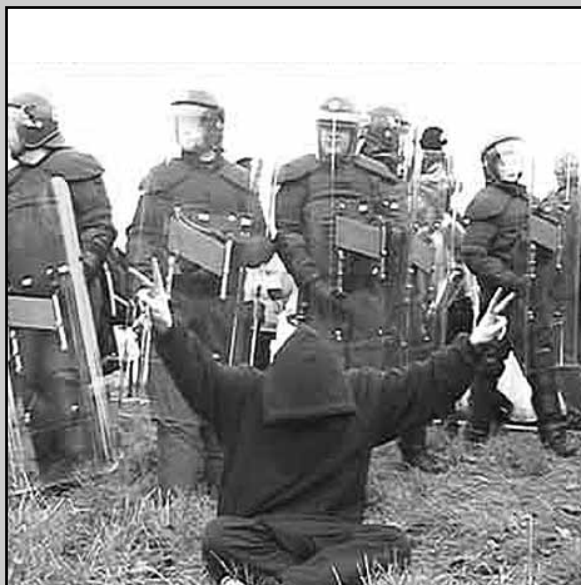
Shannon Militarised: Legitimate Protest

The IRSP totally condemns the illegal, immoral and unjust imperialist war by the USA-inspired alliance against the people of Iraq. This is an imperialist war waged for both strategic and material interests. For republican socialists our message is clear: US & Brits OUT OF IRAQ! OUT OF IRELAND!