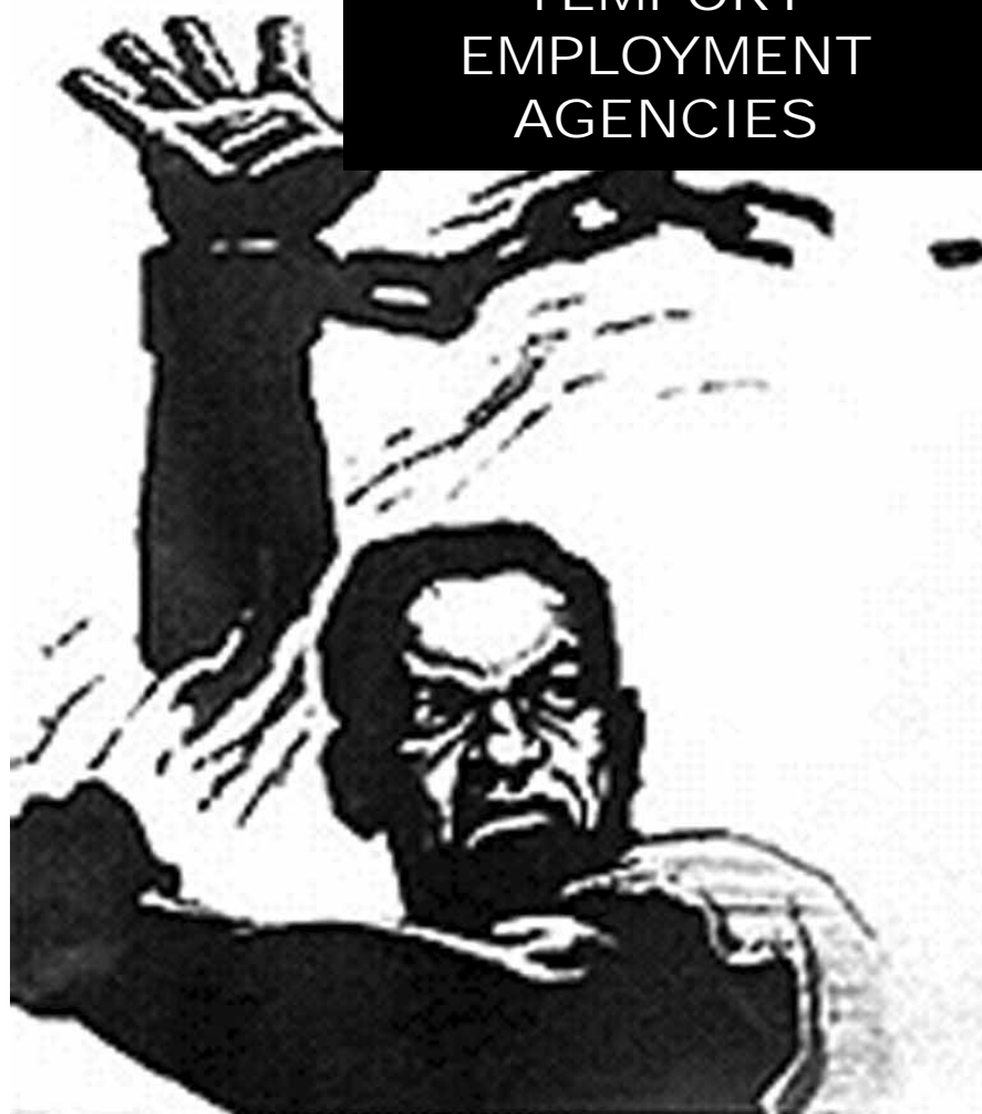
Legal Slave Trade: Tempory Employment Agencies