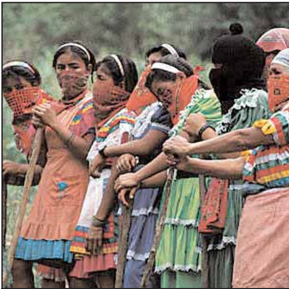
Chiapas: Viva Zapatistas

"We in the IRSP understand the growing frustration that must exist in Chiapas today, when ten years after throwing down the gauntlet, most of the problems confronting the people there in 1994 remain in place today. Recognising this, we want the Zapatistas to know that you have our sympathy and solidarity. These are small gifts to offer, in the face of so much that is wanting in Chiapas, but we understand how