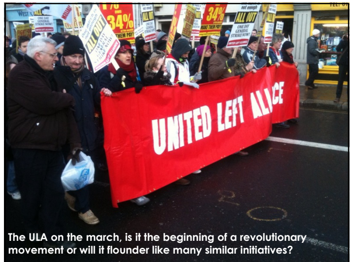
The ULA on the march, is it the beginning of a revolutionary movement or will it flounder like many similar initiatives?

Having said this, if the intention behind this formation is to simply begin negotiations and set in place the foundations for what would be a mass revolutionary party which is unambiguous about