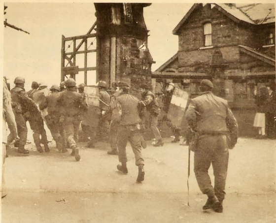
FIFTEEN Marine Commandoes are clearly visible in the picture above storming Milltown Cemetery in pursuit of 4 schoolboys. Some forty other soldiers were involved in the 'operation' which was designed to start a large scale riot.

Another Brit observation post bites the dust. Two spies, 'Alpha 1-7' was their code name, had to flee for their lives as the flames licked around them.