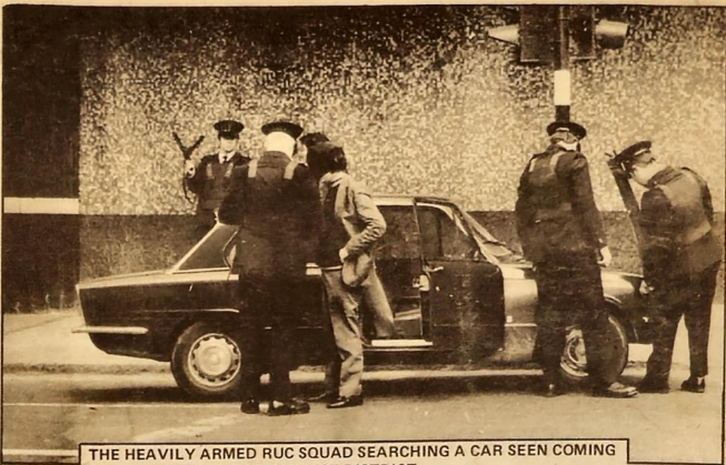
THE HEAVILY ARMED RUC SQUAD SEARCHING A CAR SEEN COMING FROM A NATIONALIST DISTRICT.

In the time remaining until the British Forces withdraw from Ireland, Mr Rees will continue to talk about the need for law and order and he will no doubt continue his futile efforts to push the R.U.C. into Catholic areas. He declares that the only lasting solution to our troubles will come with a return to normal law and order