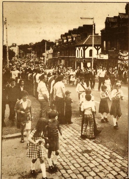
Just a section of the massive crowd who came out and showed their support for Political Status.

which was passed some years ago in an attempt to stifle the same loyalist politicians who now shriek for its implementation. (No one has ever been convicted under this act since its inception).