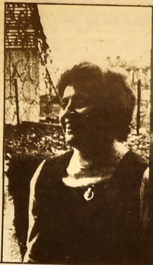
Mrs. Maire Drumm, Vice President of Sinn Fein. Pictured at her home. Mrs. Drumm is being held under an order signed by Merlyn Rees.

Mrs. Drumm stated: "when the first boy or girl is sentenced and does not get political status, will you march after us till we pull this town down. If