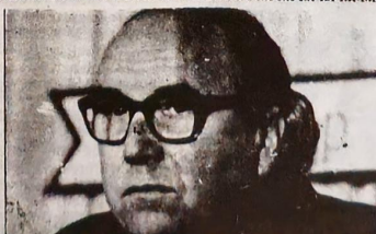
WANTED FOR MURDER

Sir, I was appalled and shocked when I saw the advertisement carried by your paper on the 4th February. Firstly, I was amazed that a government office could have taken confidential and personal information about my brother, Frank Stagg, and passed it to another government department who then proceeded to publish it in a national paper. I am taking legal advice on my brother's behalf about this, needless to say Frank had not been asked if he agreed to the publication of his private life.