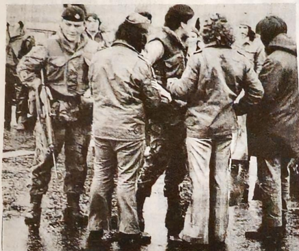
UDA men pictured with their collaborators and allies, the British Army, during the Ulster Workers Strike which was aimed mainly at the Nationalist population.

The clubs were always harassed by the police who quite frequently removed drink even from the good ones. For instance they took £1000 worth of drink from The Jolly Roger and never left it back.