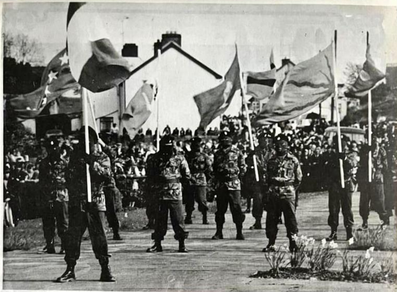
CARRICKMORE - EASTER SUNDAY 1981