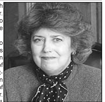
Eliza Manningham-Buller: "Head of MI5 and David Blunkett's Bulldog in the intelligence war".

The advice from the 32CSM in Britain is beware and be aware!