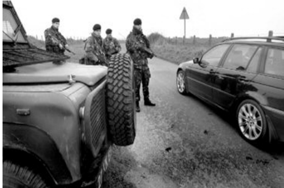
British Troops on Irish Roads

The South Down branch of the Sovereignty Movement has condemned the recent siege of the small village of Kilcoo and the destruction wrought by British Troops on the land of a local nationalist farmer.