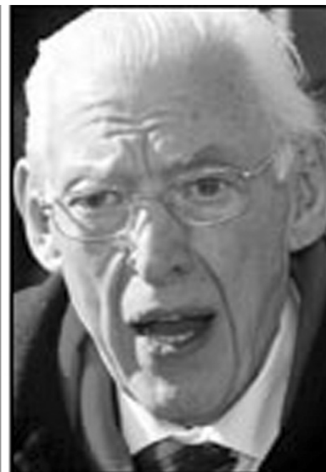
Adams and Paisley: "Opposites Attract?"

The much heralded deal to save the agreement is almost done. All the parties and the governments have to do now is to dot the i's and cross the t's. The signatories to the deal have all accepted to a greater or lesser extent that there is significant agreement and in reality what we are witnessing at present is macho posturing in order to appear 'hard-line' to their respective constituencies. The squabbling over the intricate detail of the actual implementation of the agreement is a fudge designed to mask, in Sinn Fein's case, some of the more unpalatable aspects of what they signed up to.