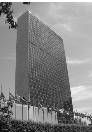
The UN: Recognized body for settling International disputes.

no way violating national sovereignty but for the Dublin administration to argue that because they had the right to hold a referendum in 1937 in the 26 county area inserting Articles 2 and 3 they now had a right to hold a referendum to remove these Articles. The actual position is this, that it would have been illegal in 1937 to hold a referendum without including the territorial position and for the same reason it was illegal to hold a referendum to remove them. So the reader will see from the above arguments.