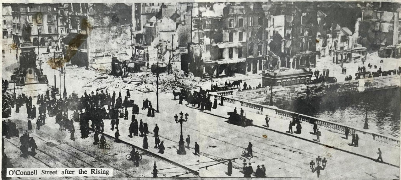
O'Connell Street after the Rising