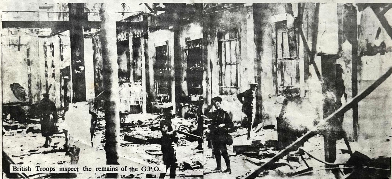
British Troops inspect the remains of the G.P.O.