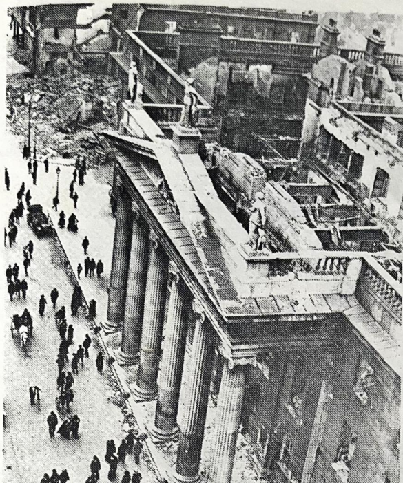
The General Post Office, Sackville Street, Dublin after heavy artillery bombardment and fires which raged for two days.