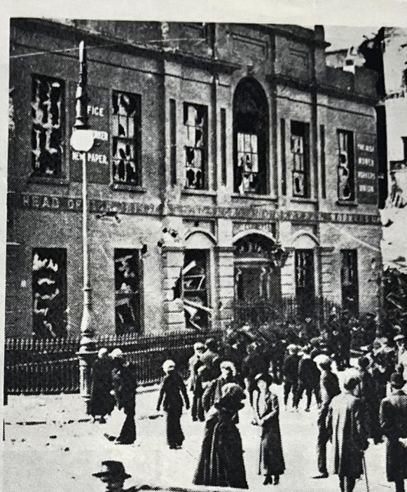
Liberty Hall, Dublin in April 1916 artillery sited in Trinity College blasted it and the gun boat Helga fired it.