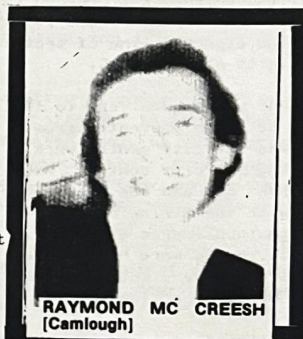
RAYMOND MC CREESH [Camlough]

Frankie Hughes once described by the R.U.C. as "the most wanted man in the north", went on Hunger Strike on the 16th March, three years to the day since he was captured, 78. Frankie was on the run for three years prior to his arrest and during that period he was constantly active despite a massive manhunt to capture him and his comrades. Frankie was finally captured after he and a comrade were involved in a gun battle with an SAS undercover