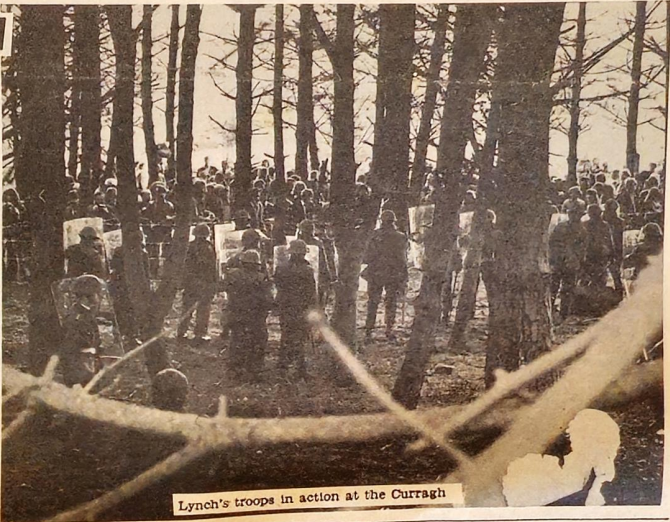
Lynch's troops in action at the Curragh