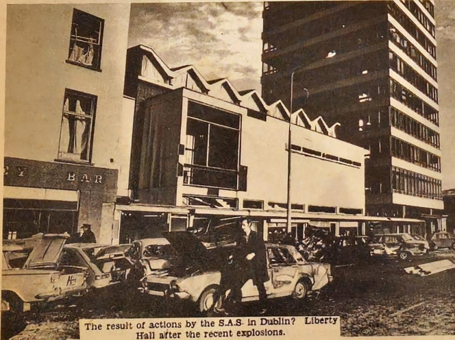
The result of actions by the S.A.S. in Dublin? Liberty Hall after the recent explosions.

We in the Republican Movement will be continuing our campaign against the RACKMANS of this city and indeed, against exploitation in all of its ugly shapes. If the people support these struggles then we cannot fail.