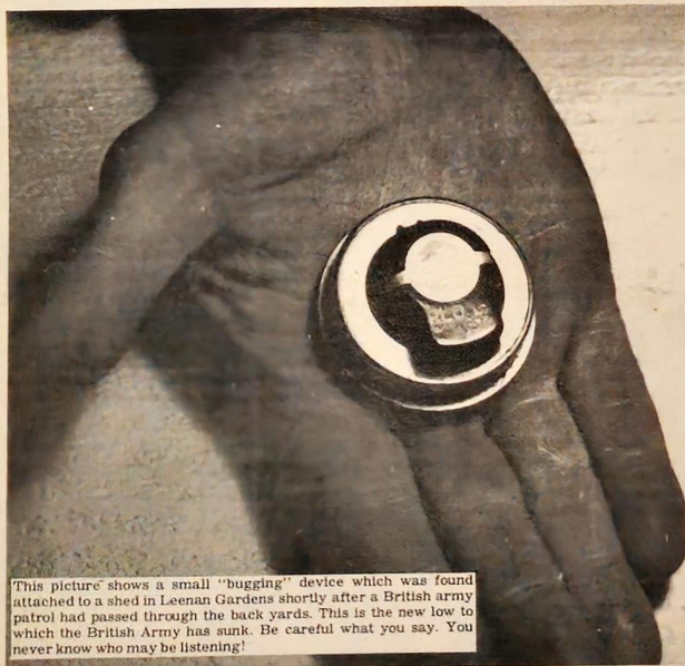
This picture shows a small "bugging" device which was found attached to a shed in Leenan Gardens shortly after a British army patrol had passed through the back yards. This is the new low to which the British Army has sunk. Be careful what you say. You never know who may be listening!