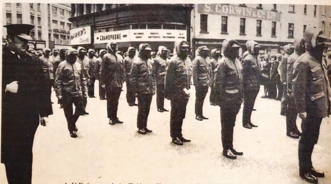
A U.D.A. march in Belfast. How long before Whitelaw moves against them?

It is notable, it is tragic that the people who flocked from the South gangsters. It will also be to the little or no comment when two service for the Derry dead made benefit of the working-class everywhere. We are not saying turn to the citizens from the Shankill Road. SDLP or the Alliance Party as you