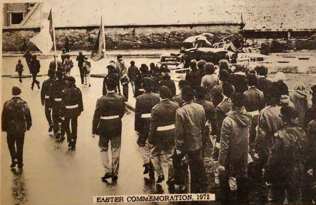
EASTER COMMEMORATION 1972

Until these demands are met we must continue to agitate against our oppressors.