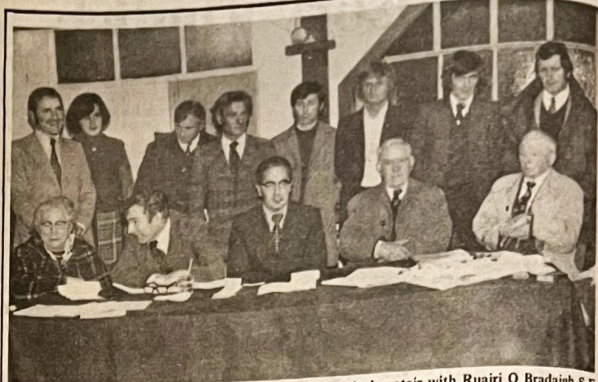
Officers of the newly elected North Kerry Comhairle Ceantair with Ruairi O'Bradaigh S.F. President and members of the Ardcomhairle at the A.G.M.

"The beleaguered people who have paid the price in blood, anguish and tears over the past seven and a half years must not be cheated out of the full fruits of their sufferings by those who would perpetuate the system of exploitation under a new and more acceptable guise. Sinn Féin will ensure that this does not happen and, for its part, Sinn Féin is prepared to meet and have discussions with any interest involved in the struggle".