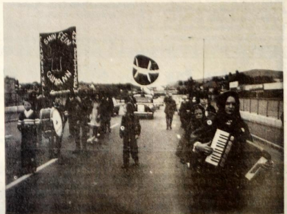
Below: End of the marchers leaving the Busy Bee, at Andersonstown. Over 1,000 walked along the three mile route to Dunville Park.