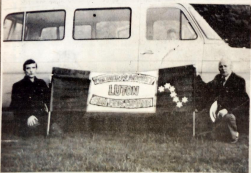
LUTON BUS FOR BELFAST PRESENTED TO GREEN CROSS '73 BY LUTON SINN FEIN (BEDS.)

What better way for them to win, than by divide and rule tactics? Ireland is the vanguard in the fight for autonomy among all celts. If she is defeated the national struggles will become despondent, and be set back another ten or fifteen years. If the fight is won now, our children will not have to take up the struggle we failed in. Irish Republic - and, as a fellow Republican let me urge you - no surrender - stick it - and you shall win.