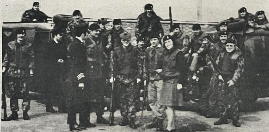
Members of the three arms of 'British Law and Orange Order' (Brits, RUC, UDR) mingle together for propaganda purposes.

On at least one occasion they have silenced one of