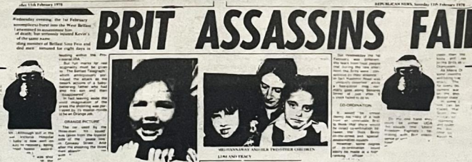
Centre spread story from "Republican News", Saturday, 11th February, 1978.

Whichever force is responsible for this latest attack it underlines the importance of all Republicans making safe their movements, as further assassination attempts can be expected.