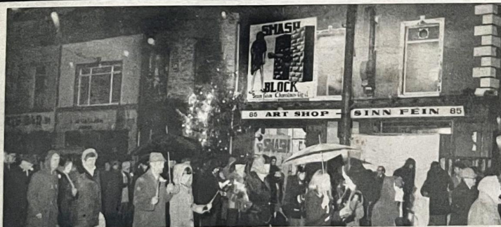
Torchlight procession on the Falls Road, Belfast.