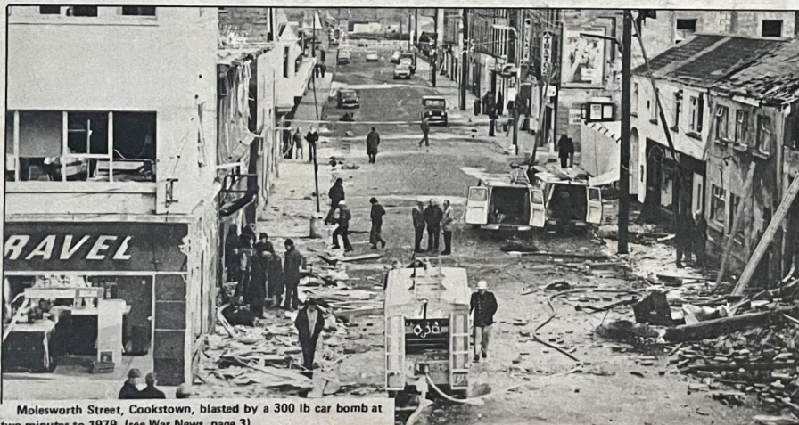
Molesworth Street, Cookstown, blasted by a 300 lb car bomb at two minutes to 1979. (see War News, page 3)

In support of that thinking will be a united paper — the joint circulation of AN PHOBLAUGHT and REPUBLICAN NEWS at 31,000 weekly, far exceeds any other political paper in Ireland!