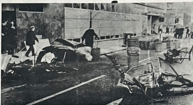
Aftermath of I.R.A. car bomb in High Holborn, London.

With Brit 'security' as bad as this no wonder Scotland Yard are panicking in the face of a renewed I.R.A. bombing campaign in England.