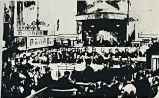
The Manchester Martyrs on trial in England 1867