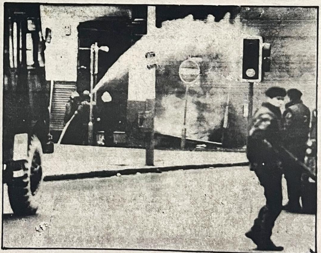
HOBSON'S SHOP BOMBED IN GT. VICTORIA St. BELFAST