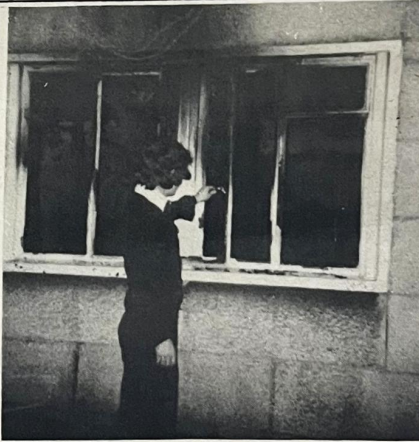
EXTENSIVE DAMAGE CAUSED TO GROUND FLOOR