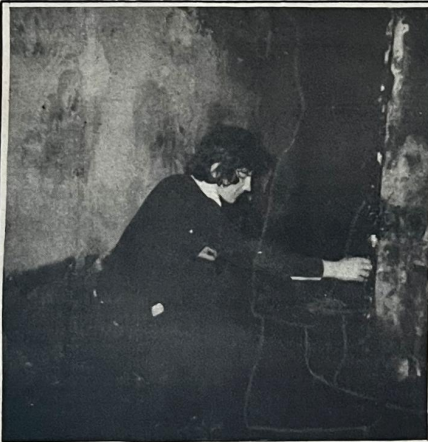
A MEMBER OF THE P.F.S. EXAMINES DOWNSTAIRS SHELL OF No. 42 DIVISMORE Pk.