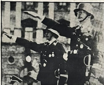
As manufacturers of confessions they (R.U.C.) set about their work with the exuberance of children at play, just like the South African state police on Steve Biko or the Waffen SS in Hitler's Germany.

Statement, issued by Brady-Carr Sinn Fein Cumann, Derry.