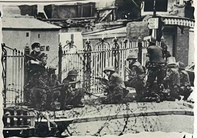
BRITISH ARMY ON THE STREETS OF DERRY - Their governments policy of repression against the Irish People, especially in the Jails and Concentration Camps is increasingly being countered by the people coming out onto the streets in protest.