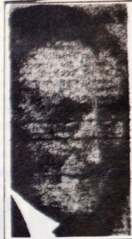
CHICHESTER-CLARK will march on the 12th July