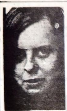
BERNADETTE DEVLIN in jail for doing what thousands of others did.