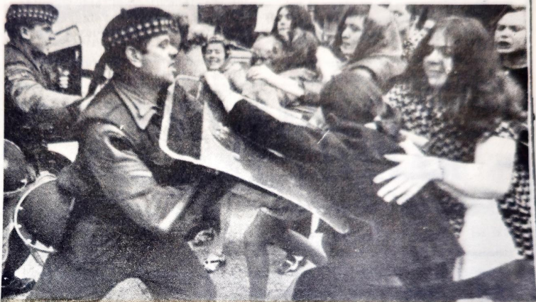
SOLDIERS ATTACK PICKET OF WOMEN FROM NEW LODGE ROAD