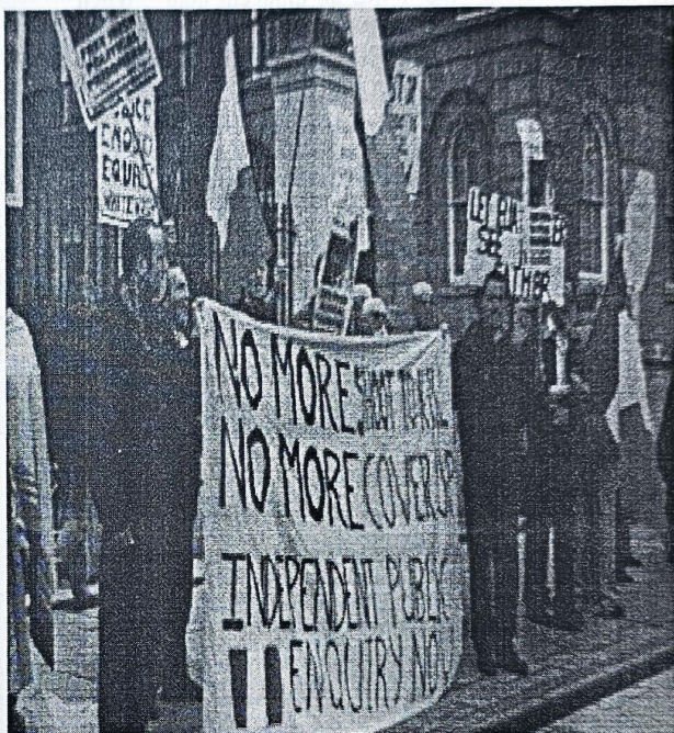
Fuascailt and Irish groups protest at Downing St