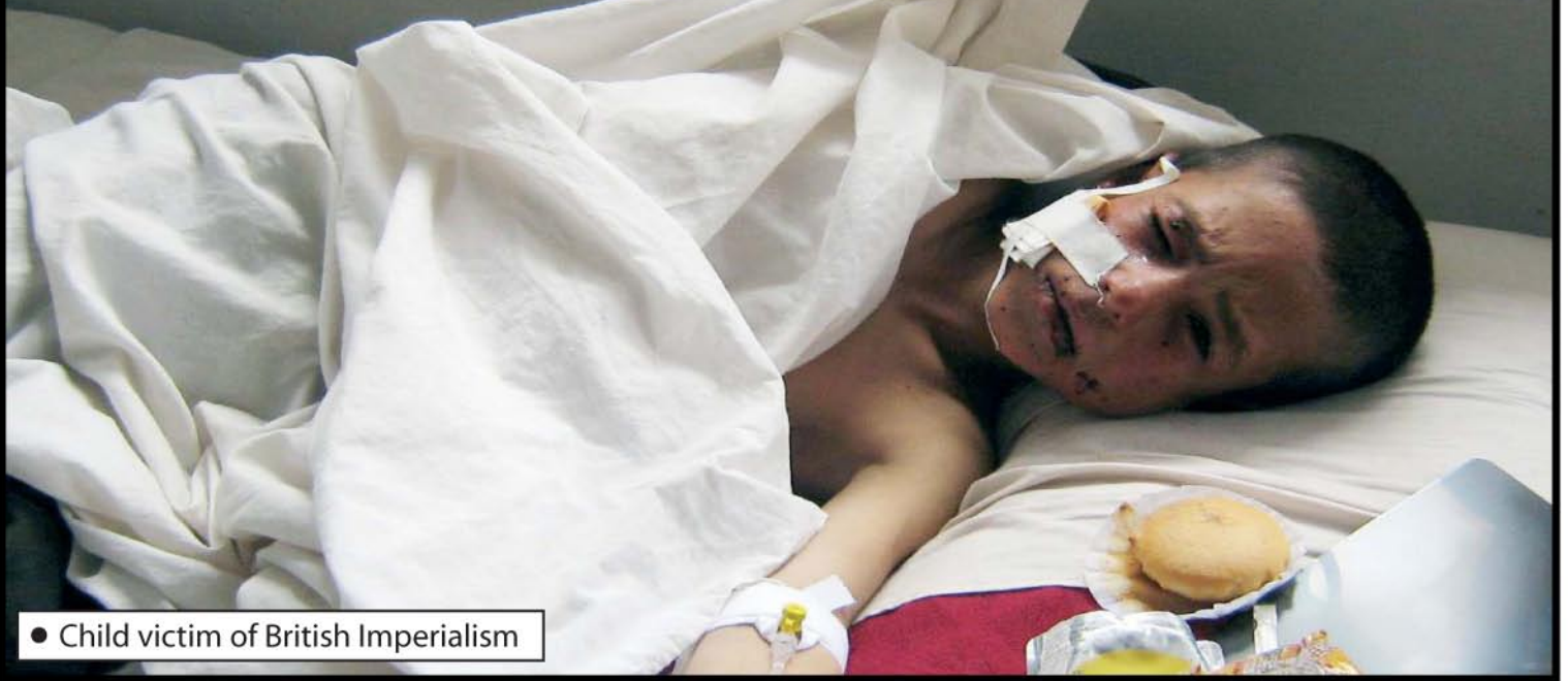
● Child victim of British Imperialism

The British Army has a long and bloody record of imperial occupation across the globe. In recent years the people of Iraq and Afghanistan have been subjected to the terror of Elizabeth Windsor's army of occupation.