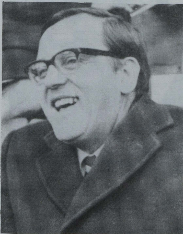
MR. MERLYN REES encouraged Provos to think in terms of control of areas.