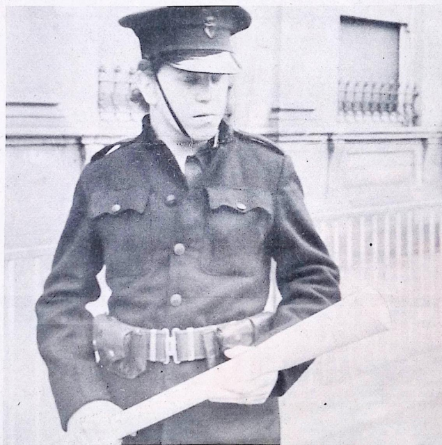
This man is a B-Special. There are 10,000 thugs like him loose in the North this moment. Apart from pick-axe handles, they are armed with the most modern weapons, automatic rifles, and machine guns.

Lynch has protested in vain to Wilson. What has to be done now is to mobilise the Irish people — all the resources of the people in the 26 Counties — and send in the Irish army to protect the people from the Orange mob.