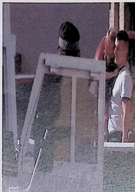
Little girl is comforted by her father as their home is raided by armed British police officers

They condemned what they called 'valid threats', invited the 32csm to enter discussions, 'if they are serious about their political ideology' and then ended their statement by claiming that this is 'a time when the majority want to use the ballot box rather than the bullet.' This is a strange way to offer 'mediation' and rather than contact the 32csm they chose the front page of the Derry Journal. At the end of the front page article the Journal admitted to seeing the letter. However, this didn't prevent them carrying an editorial on page two with