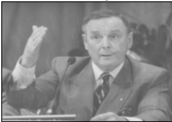
General John de Chastelain: oversaw destruction of PIRA weapons

Politics can be a disgusting or indeed an amusing spectacle. It all depends on your political perspective. For example, who could have predicted that a one-time former head of the British Anti-Terrorist Branch would travel to Belfast to admonish the provisional movement for failing to destroy its entire arsenal? And that Martin McGuinness would dismiss these findings using expletives, before grovellingly reasserting that PIRA weaponry had been completely destroyed and that Sinn Féin is entitled to British ministerial portfolios in a Stormont power-sharing executive? Fifteen years ago an author of spy thrillers would have discarded that particular plot as absurd and unbelievable.