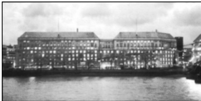
Thames House - MI5 Headquarters, London