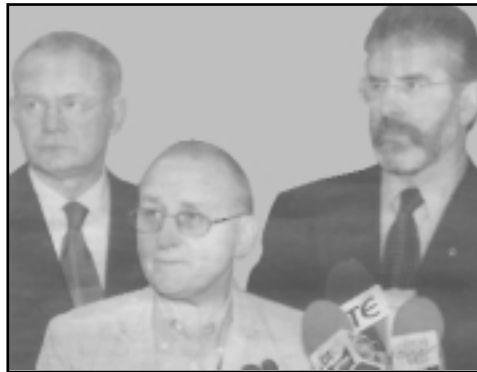
McGuinness, Donaldson and Adams

British intelligence recruited informants, imprisoned experienced IRA activists and ambushed and executed hardline active service units as part of its campaign to weaken the IRA. An iron fist was brought to bear on republican heartlands hostile to the new Adams-McGuinness strategy. For example, the hardline and vehemently anti-Adams IRA East Tyrone Brigade