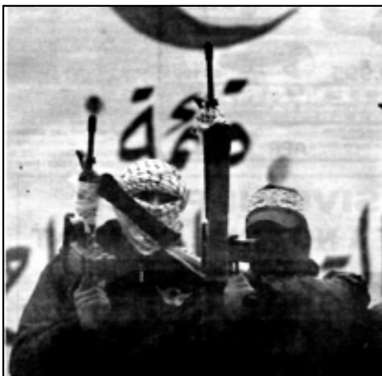
Members of the Al-Aqsa Martyrs Brigade demand the resignation of the Fatah Central Committee

colonisation of Palestinian land has accelerated under Oslo, in flagrant violation of countless UN resolutions and Article 49 of the Geneva Convention which states: "the occupying power shall not deport or transfer part of its civilian population into the territory it occupies". Tragically, history illustrates Israel's absolute contempt for international law. The fifteen years following the 1967 War witnessed 21,000 Israeli Jews colonise parts of the West Bank, Gaza and East Jerusalem. By 1990 this figure had increased to 76,000. However, by 2000, seven years after Oslo, the number of Israeli colonisers in the occupied territories stood at 383,000. In 2004 the infamous Sharon "Security Wall" expropriated further land, as if Palestinians required further proof of the fraudulent nature of the so-called peace process.