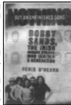
Nothing But An Unfinished Song

Nothing But An Unfinished Song has had a controversial public introduction. It has been born of false and misleading claims, and according to Bobby Sands' sister, the biography contains "numerous factual inaccuracies". I don't believe this will be the last word in relation to this controversial book.