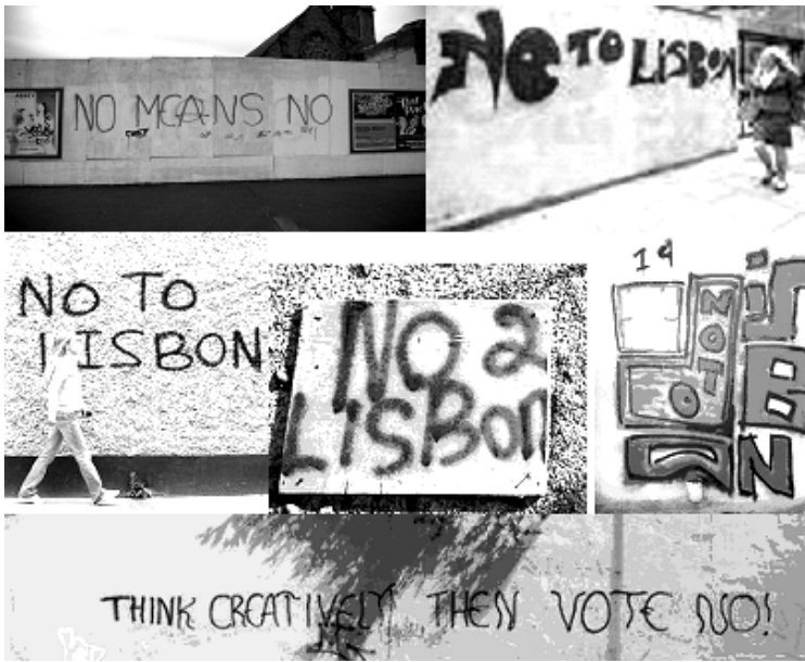
No to Lisbon graffiti

It is now widely acknowledged and supported by the public that we need more accountability and control over our economy so that never again can we be left at the mercy of greedy speculators, developer and bankers.