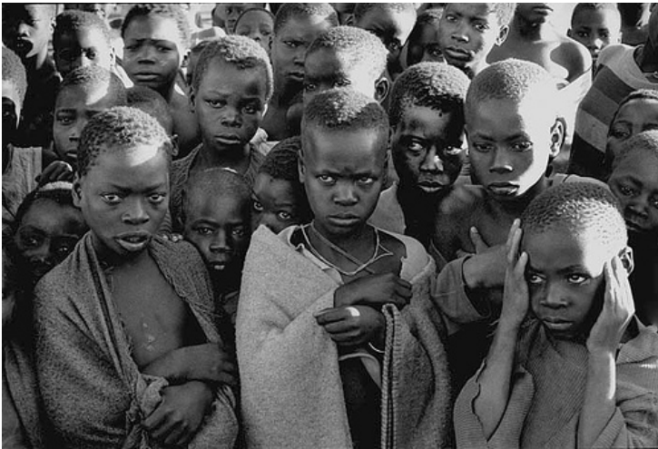
Why make them suffer?

The Capitalist system is in crisis. The worst hit are the poorest in neo-colonies of imperialist countries. Ignoring this, the establishment pumps billions into the very institutions that caused the crisis.