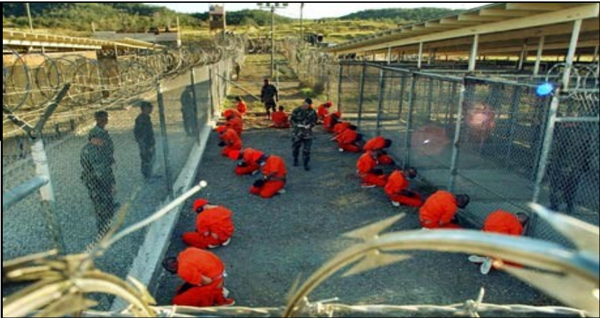
Detainees in orange jumpsuits kneel in a holding area at Camp X-Ray, Guantánamo Bay, Cuba, in January 2002. On the camp's ninth anniversary, 75 of the remaining 173 detainees have been cleared for release, yet remain in custody.

During their protest, the prisoners shouted slogans and were also ad-