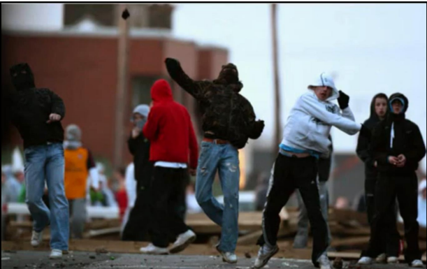
Craigavon and Lurgan resistance to the arrest of those charged with the shootings of two soldiers and a policemen in 2009. Support the struggle for political status for Republicans in Portlaoise, Maghaberry Prison and elsewhere. Write to the POWs and send them whatever literature they need. Contact the Irish Republican Prisoners Welfare Association ( http://irpwa.blogspot.com/ , irpwa@mail.com ) for details of how you can help.

Maghaberry Gaol Roe 3 Old Road Ballinderry Upper Lisburn Ireland BT28 2PT