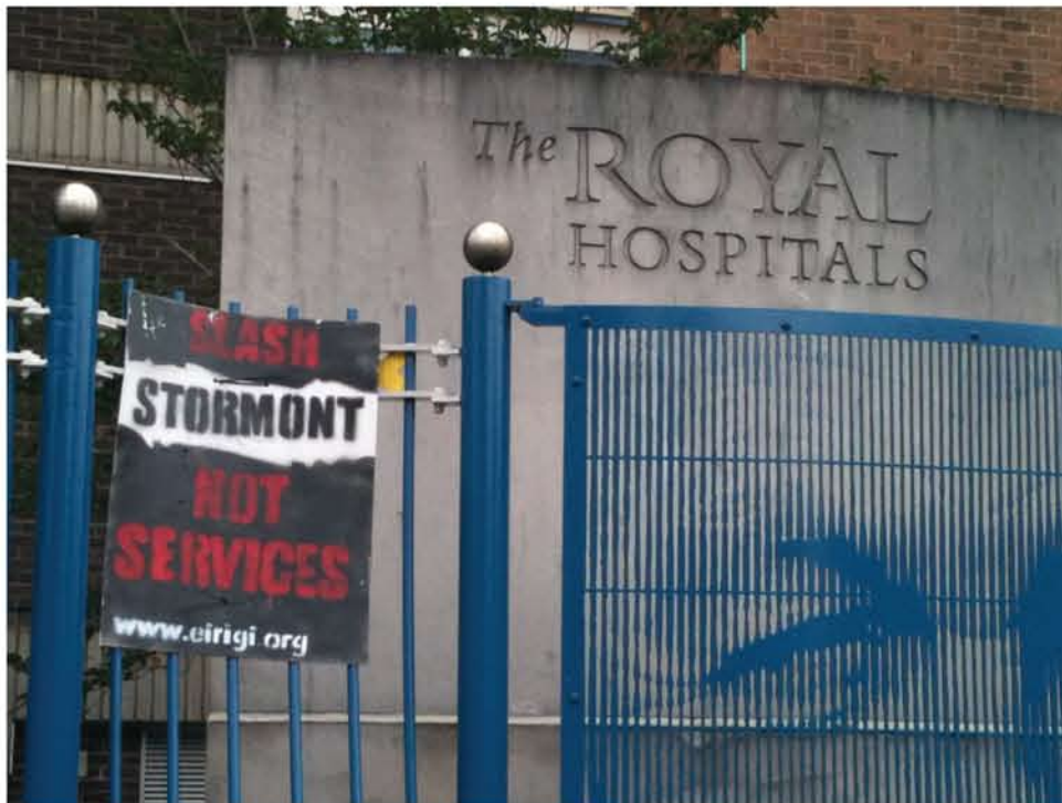
• Slash Stormont, Not Services

They only did so after realising the extent of public opposition. Their late conversion did not prevent the workfare measure being passed.