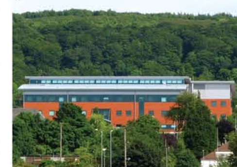
• MI5's £20 million Palace Barracks headquarters in Hollywood opened in 2007

"No amount of Stormont spin can change that."