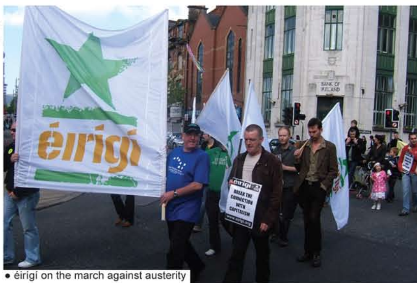
• éirigi on the march against austerity

Now is the time to organize within communities against this.