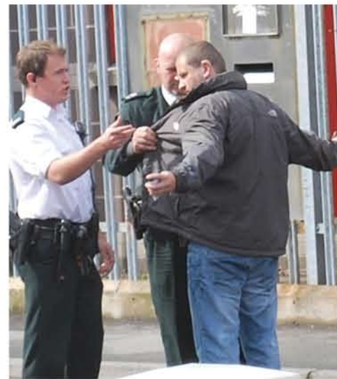
• Stop & Search under way in Newry

Record all details while they are fresh in your mind and log all incidents of harassment with a solicitor.