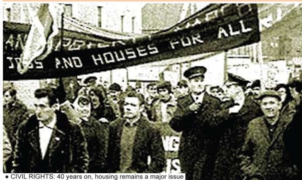
• CIVIL RIGHTS: 40 years on, housing remains a major issue