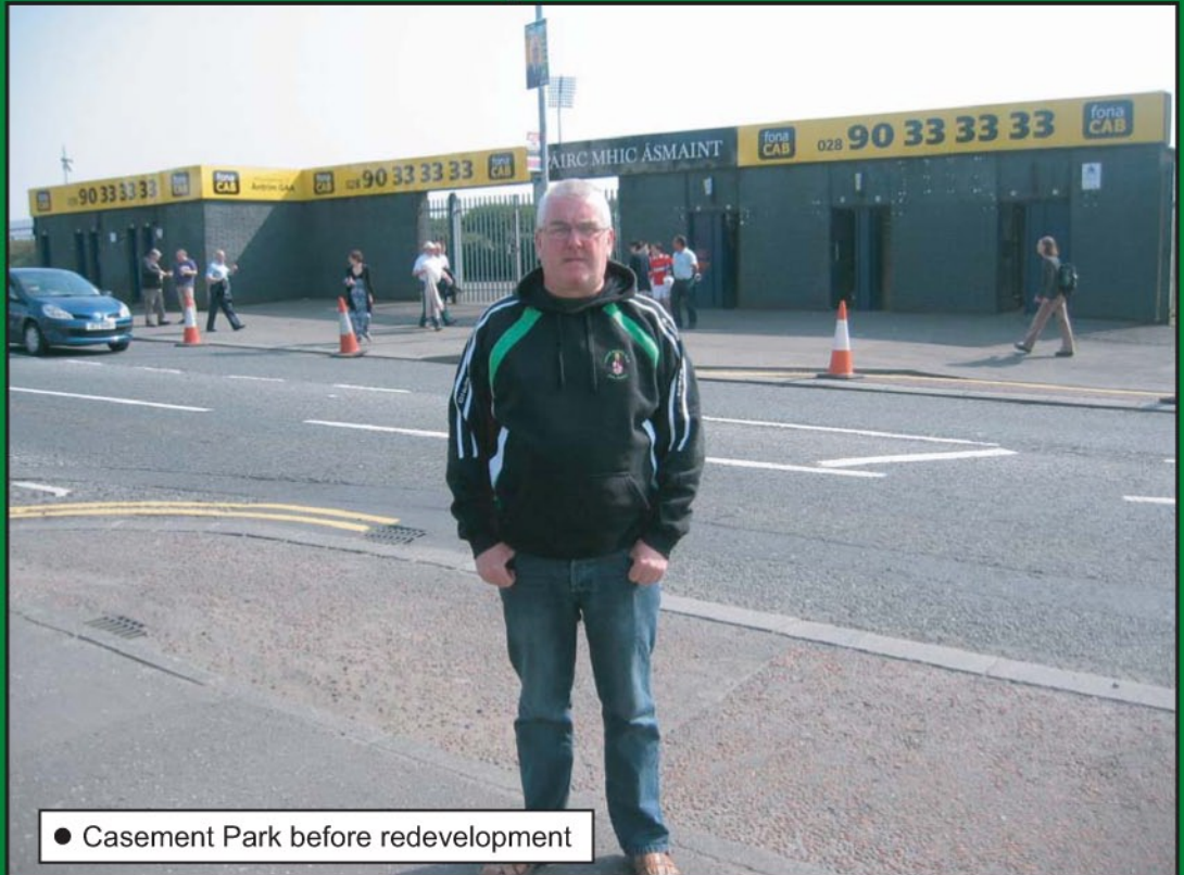
● Casement Park before redevelopment

Pádraic continued: "The redevelopment works and the increased attractions that will come to Casement as a result of the redevelopment provide massive opportunities for Andersonstown and the greater West Belfast area. These opportunities must not be squandered. Every effort needs to be taken to ensure