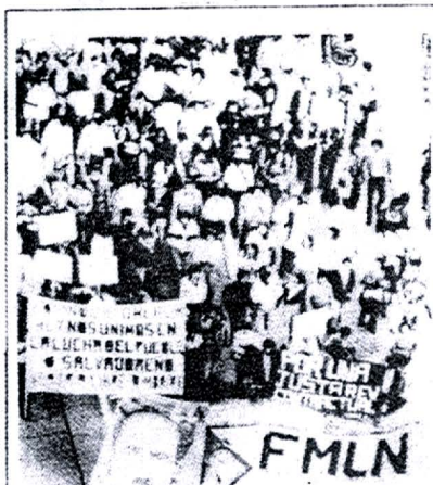
Mexico City protest in support of struggle in El Salvador. Estimates of number participating in January 22 march ranged from 50,000 to 100,000.

Once more, the most powerful government on earth has been guilty of genocide, just as it was in Vietnam and in so many other countries. That is the only conclusion you can come to when you consider the current war in El Salvador, for it is the US governments of both Carter and Reagan that have armed to the teeth the Salvadoran military/Christian Democratic junta, its army and associated death squads which were responsible for the deaths of an estimated 10,000 people in El Salvador in 1980.