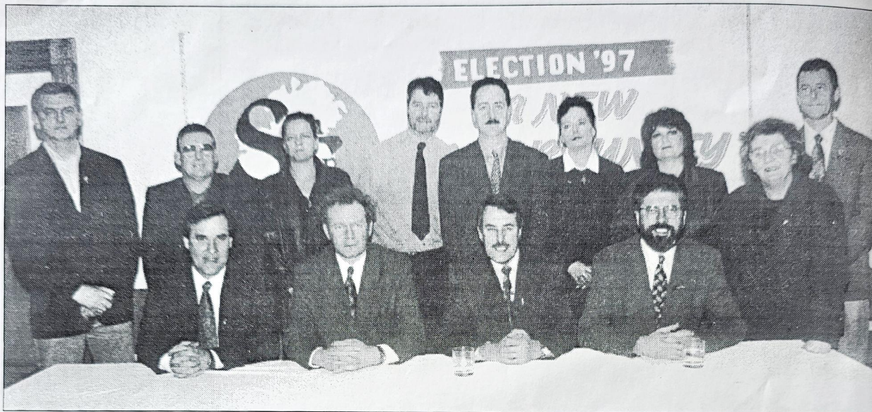
Sinn Féin President Gerry Adams pictured with Local Government Candidates.