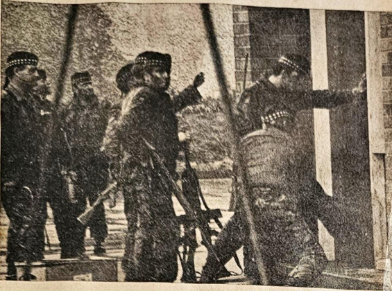
THIRSTY BRITISH TROOPS LOOTING THE TELSTAR BAR, CREGGAN.

What did the British bring to you when they "liberated" your area?