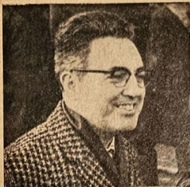
Ruairi Ó Bradaigh President of Sinn Féin

In future issues of "Volunteer" a series of articles outlining the policies and objectives of the Sinn Féin organisation will be published.