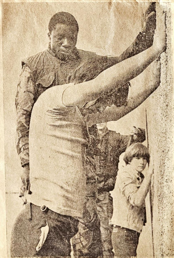
Same type of wall Different colour.