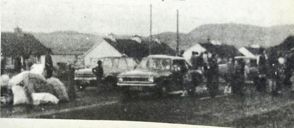
BELOW: The protest caused considerable traffic congestion.