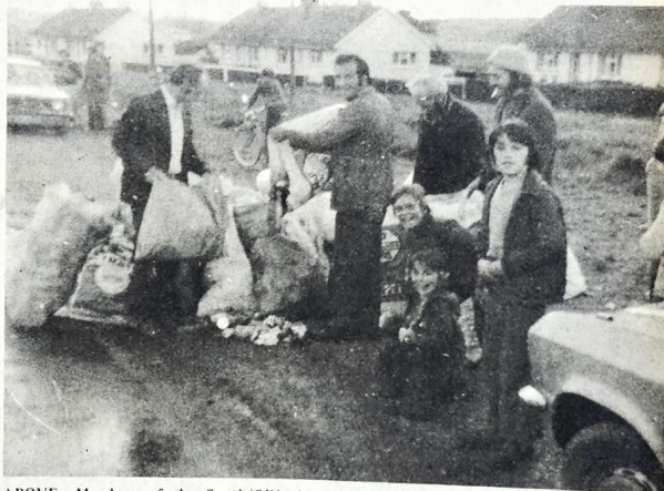
ABOVE: Members of the South/O'Hanlon Sinn Fein Cumann dumping garbage on the Letterkenny Road, near Burt.

The Cumann has also called upon the county Council to provide a water supply in the Burt area.