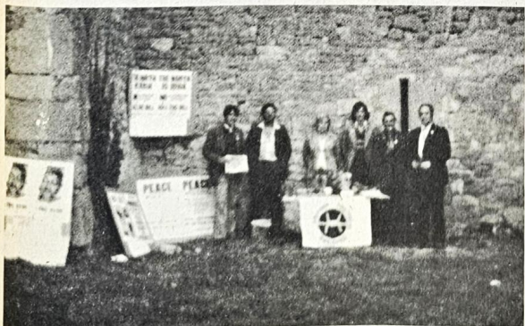
* Our picture shows members of the Shannon S.F. Cumann protesting outside Bunnatry Castle in support of the Republican prisoners. The protest took place as one of the famous Mediaeval banquets were getting under way in the castle.