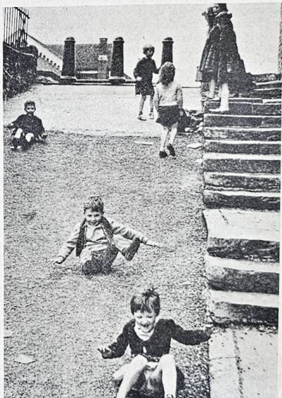
amatéarachais thart. Tá práinn

● "Is féidir le Raidió na Gaeltachta anois, ach cur chuige go fearúil, an oidhreacht agus an tradisiún a neartú agus a chaomhú don ghluin ón aghaidh glúnta atá ag teacht ina ndiaidh. Tá seo á dhéanamh acu.