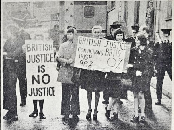
In Derry members of Sinn Fein picketed the Autumn Assizes of the Crown Court at the opening on October 16. Members of the R.U.C. prevented the pickets from entering the courthouse.