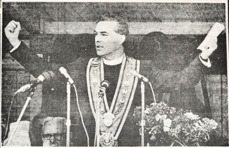
The Rev. Martin Smyth, Belfast County Grand Master, speaking from the platform at Finaghy.