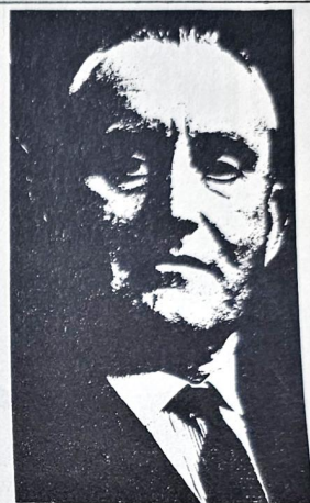
CLARK - HIS MASTERS' VOICE

Some people think they can win the support of Protestant workers by supporting the 'Prentice Boys against the Government. They would win more by joining an Orange Lodge. But the mass of Protestant workers will only be won to socialism over the carcass of the Orange Order. It is the job of socialists, not to defend these bigoted organisations, but to point out to