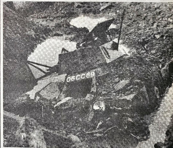
The British Army ferret car lies in the crater on the main Lisnaskea-Newtownbutler Road after it was ambushed on November 6th.

In Magherafelt a proxy bomb wrecked several business premises at Union Road. Earlier a man was hijacked and his mini-bus loaded with 500 lb. of explosives. He then drove the mini-bus to the local Co-op. British bomb experts tried to defuse the bomb, which was attached to a 40 gallon oil drum but failed.