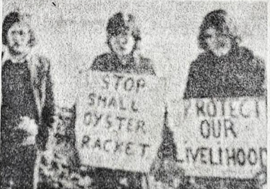
Fishermen on picket duty at Fenit, Co. Kerry.

This happened recently when local fishermen were out in force, picketing areas along Tralee Bay, carrying placards with these messages: "Stop Small Oyster Racket", "Enforce the Law", "Conserve our Pyster Fishery" and "Protect Our Livelihood".