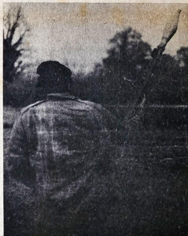
IRA Freedom Fighter 1973