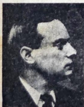
P. H. PEARSE