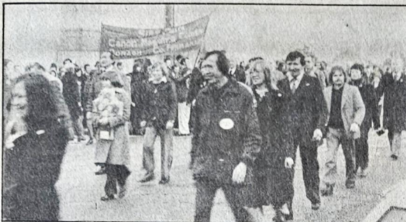
Members of the Stagg family taking part in the Commemoration parade.