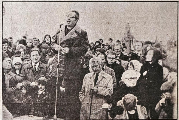
An tUachtarán, Ruairi Ó Brádaigh, delivering the oration at the Proinsias Stagg Commemoration in Ballina.

"For the strength that will support a man through every phase of this struggle, a strong and courageous mind is the primary need - in a word Moral Force. A man who will be brave only if tramping with a legion will fail