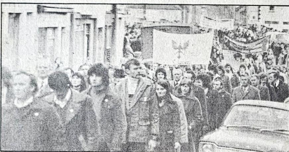
A view of portion of the parade through Ballina.

(Ar leannúint ó le h) Uganda and subsequent secret burial of the bodies. This event ranks alongside the treatment of Proinsias Stagg's body. It shows the close relationship between tyrants everywhere.