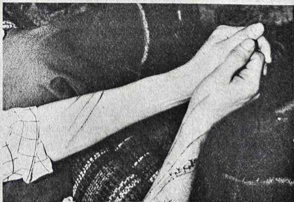
OUR picture shows some of the injuries suffered by a youth who was stopped by the Paras in West Belfast recently. His forearms and face have been slashed — he had to receive 11 stitches in one very deep wound.

"Such an inquiry must extend to all instances of brutality towards all prisoners, not only in garda barracks but also in Port Laoise Prison," the statement ended.