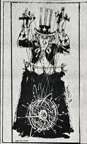
Cartoon is reproduced from U.S. paper, "The Militant".

He travelled throughout the country setting up cells. The peasants, workers and students loved him but the United Front leadership was too fragmented to agree on tactics or policies.