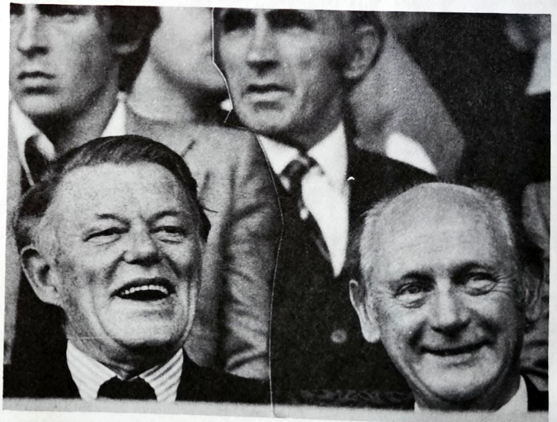
"On the Sunday when the Centenary of Michael Davitt, founder of the Land League, was being co-memorated at Stride, Co. Mayo, Jack Lynch was entertaining the British Ambassador at The All-Ireland Hurling Semi-Final at Croke Park".