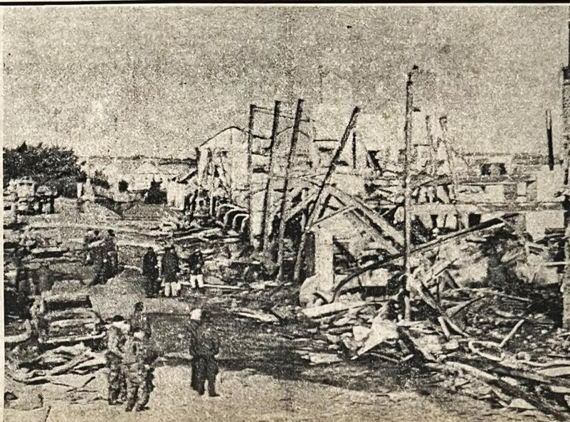
English Soldiers gaze at the remains of their canteen at Ballykinlar Military Camp after a massive explosion completely wrecked it on Monday.

At the massive Troops Out Movement march and rally in London, last Sunday, agent provocateurs were obviously about their usual dirty work. Photographers who were not accredited Pressmen were observed distributing placards and posters to unfortunate onlooking drunks and then photographing them. By doing this they sought to discredit this most successful protest, inferring that this was the calibre of the supporters. Instead their action was self defeating, drawing the attention of genuine newsmen, even the B.B.C., reported this charade.