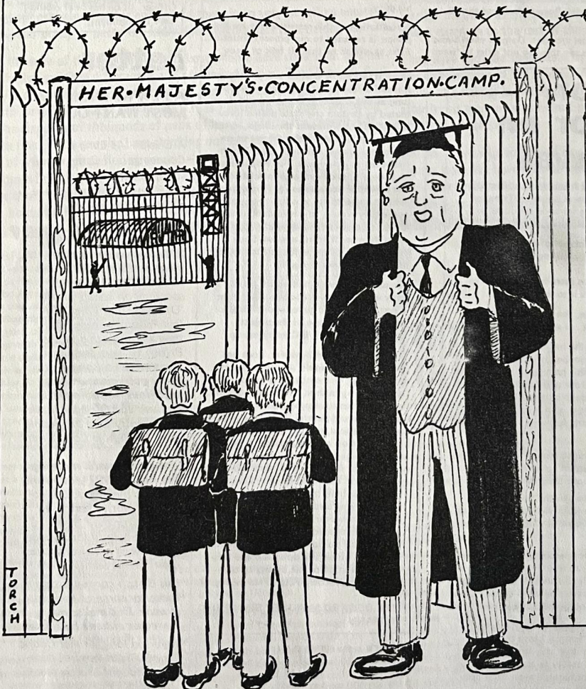
"GOOD MORNING BOYS"

AS THE NIGHTS GET LONGER AND BRITISH CASUALTIES HIGHER IT IS BECOMING OBVIOUS THAT WE ARE INTO THE HOME STRETCH.