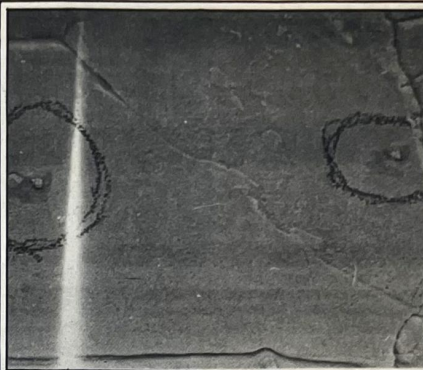
Bullet holes in Donegal Celtic Social Club.