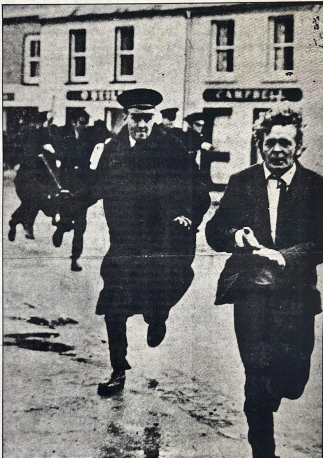
The RUC in action in 1969

The brutal road from RUC custody to H-Block Long Kesh must be permanently and forever demolished. We call for the obvious: the immediate closure of Castlereagh and the disbandment of the notorious RUC. But we know full well that the British regime here, ruling by absolute force and tyranny, can afford to do neither. Until British rule is ended here once and for all time, Castlereagh and murder by the RUC under torture will be an unfortunate fact of life for our people.