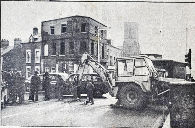
One of the hundreds of road blocks in support for the men behind the wire.