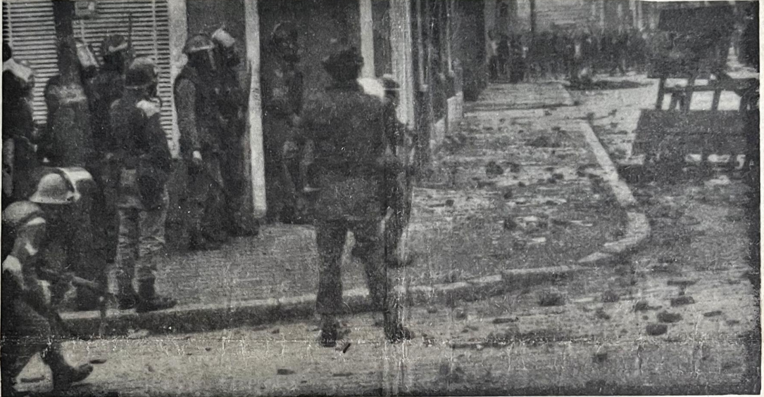
At a street corner on the Lower Falls Road, Belfast, July 3, 1970. British occupation troops prepare to attack Irish people in their own city.

T HE past week has seen a further escalation of events in the Six Counties starting with the arrest of Bernadette Devlin on her way to Derry and culminating in the tearing apart of the entire Lower Falls Road area of Belfast by 2,000 British troops supported by heavy armour.