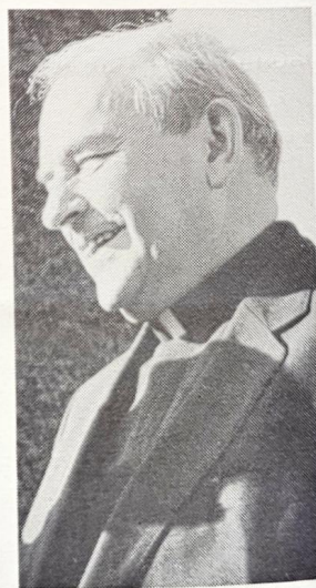
Cardinal Tomas O Fiaich

"During the appeal of the Birmingham Six last year, four members of the bishop's conference attended the court in order to show their concern that justice should be done," last year's statement said. "The Bishops had hoped that in view of the verdict in the appeal court clemency would have been shown to men now in the fourteenth year of their imprisonment."