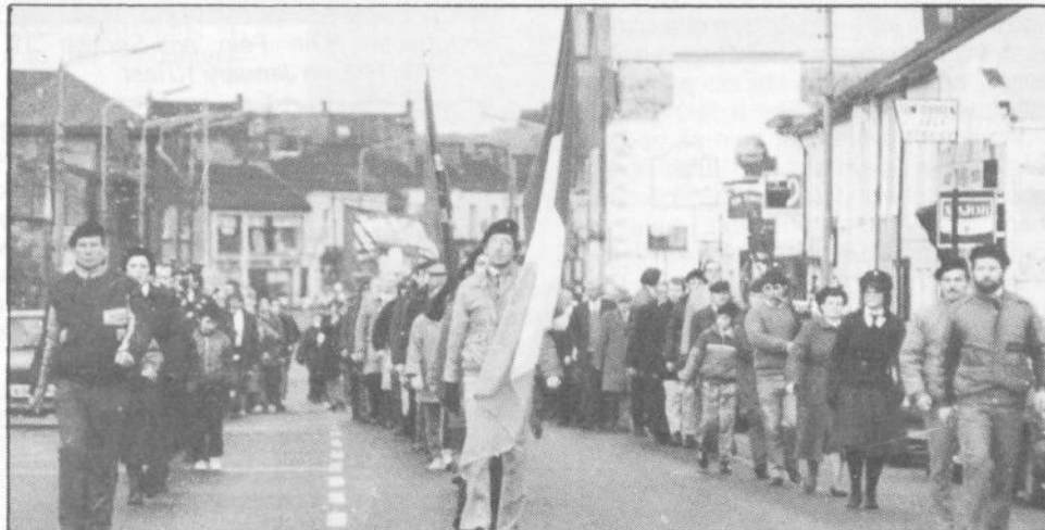
A Colour Party leads the parade to Seán Sabhat's grave in Limerick. See pages 4 and 5.

was officially recognised and copperfastened by the Hillsborough Agreement, and emigration, unemployment, taxation and poverty went from bad to worse. The next four years will just see more of the same.