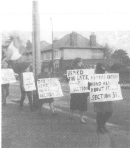
Republican Sinn Féin anti-Section 31 picket on RTE on January 10 last.

Honour Ireland's Dead — Wear an Easter Lily