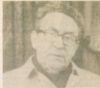
• George Harrison

In the course of his trip Dáithí Ó Conaill met a number of influential leaders of the Irish-American community and briefed them on the position of Sinn Féin Poblachtach. The updating of the EIRE NUA policy was warmly received by all.