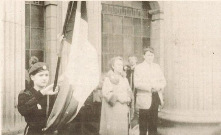
•Fianna member of colour party at the GPO, Dublin at noon on Easter Sunday.

BEARNA Uladh launched its programme of commemorations at Camloch on Easter Saturday evening. Gathering at Carrickcruppin graveyard the modest crowd