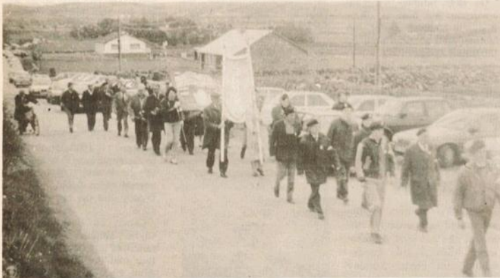
• The Galway parade, including many people in cars due to the showery weather, makes its way to Donagh Patrick Cemetery.